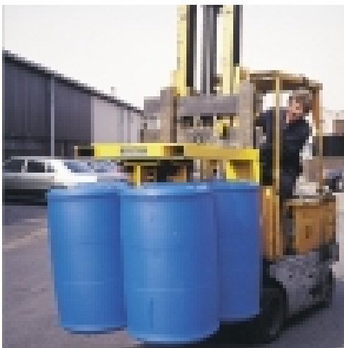
Dependable stacking strength with high load gearing potential

The L-Ring drum has since set new standards in rigid plastics transport packaging. It is now universally regarded as the most reliable large drum of its type for liquid products. Including many dangerous ones. Harcostar L-Ring drums afford the same degree of protection for many filling goods as steel drums, but they are much lighter in weight, easier to clean for re-use and unlike steel drums, they do not corrode, nor are they easily damaged. All of which provides for a long service life with the minimum of maintenance.