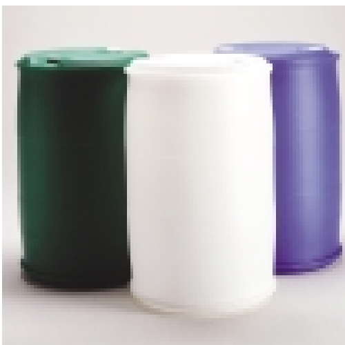
Recessed centre label panel