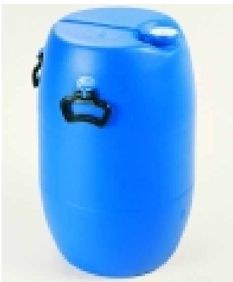
Plastic overseas can be fitted for effective tamper evident protection