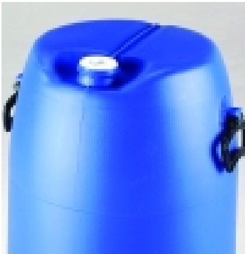
Safe and easy to handle

Developed under license from Mauser-Werke GmbH of Cologne, the 60 litre Tight Head has been thoroughly proven over many years, used by leading food and chemicals manufacturers throughout the world.