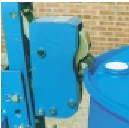
New style lifting ring

The XL-Ring is endorsed by the Federation of German Reconditioners (VDF)